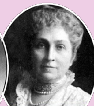
PHOEBE APPERSON HEARST